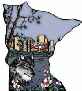
PHOTOGRAPHIC SOCIETY OF AMERICA 86 TH ANNUAL INTERNATIONAL CONFERENCE OF PHOTOGRAPHY SEPTEMBER 8-11, 2004 Bloomington/Minneapolis/St. Paul MINNESOTA