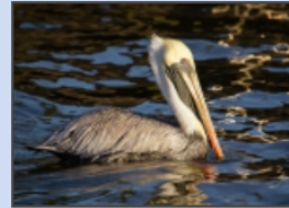
Adult Brown Pelican Image Id=8489874

Remove from Competition, Keep in Image Library